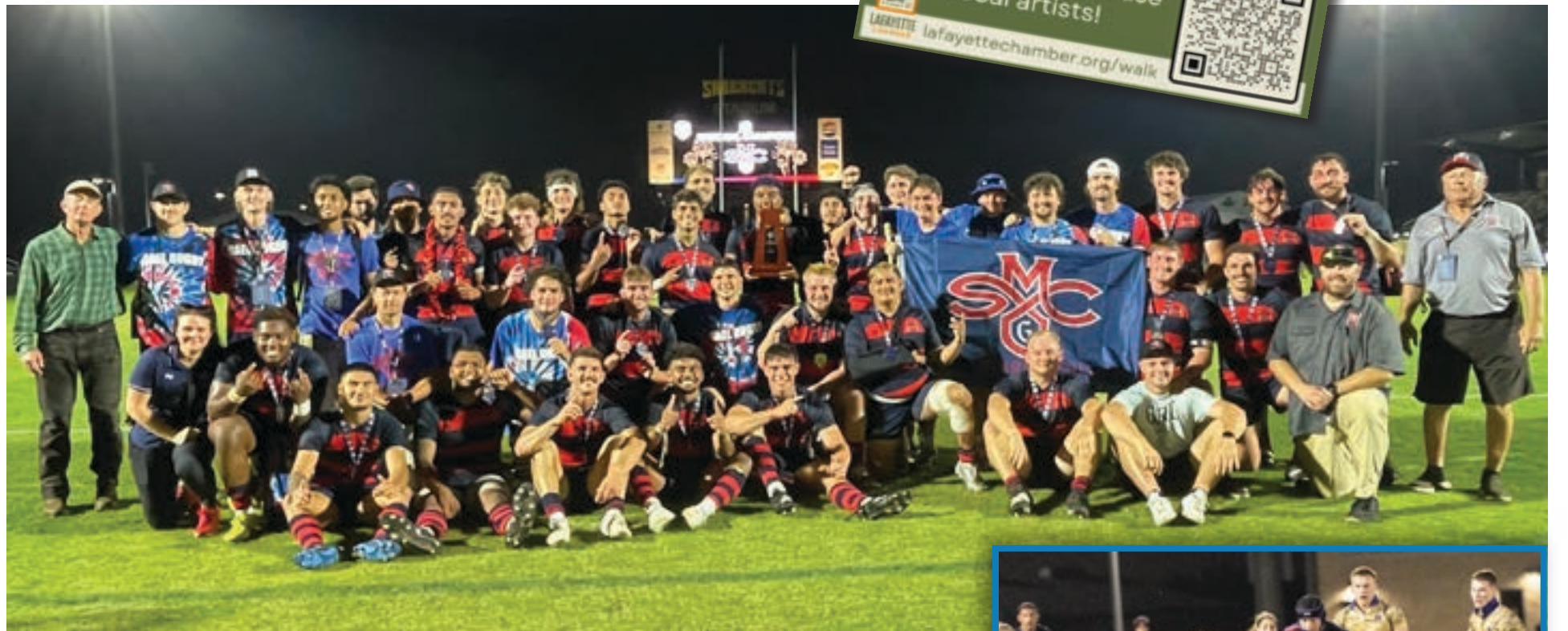
St. Mary's Championship Rugby Team